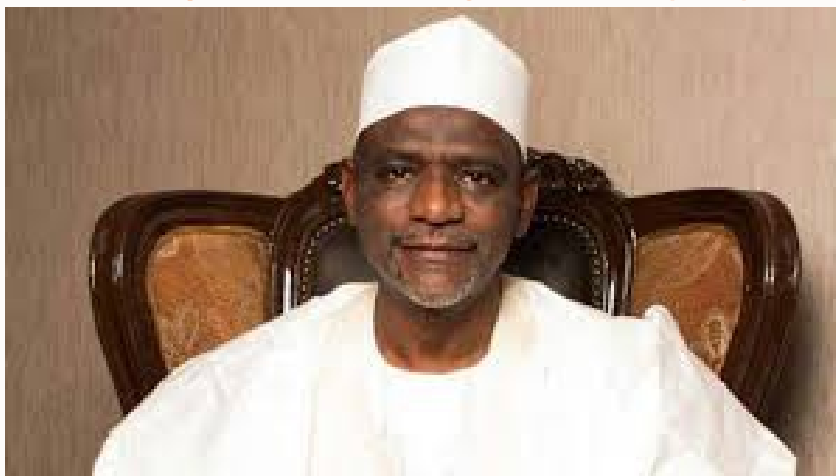
■ The Honourable Minister Of Education, Malam Adamu Adamu.

... Says Operations Of Illegal Campuses And Their Affiliates Are Over, Sets up National Standing Committee (NSC)