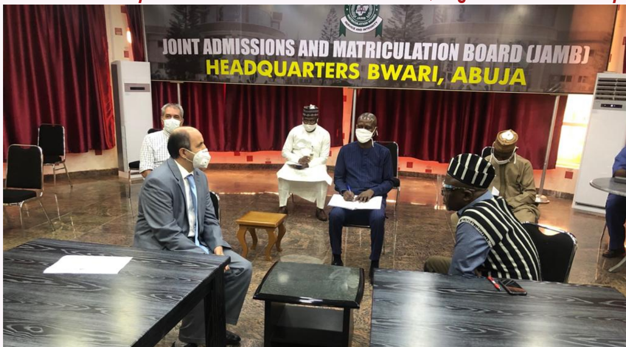
The Management of Nile University in a meeting with JAMB Management