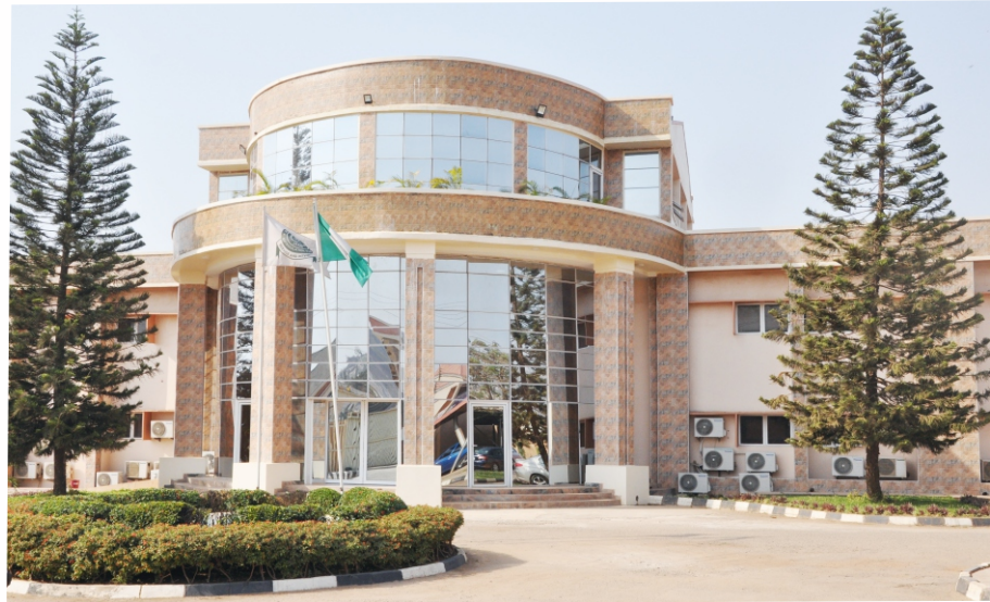
Joint Admissions and Matriculation Board (JAMB), National Headquarters Complex.

...Experts To X-Ray Desirability and Implications Of Safety Measures