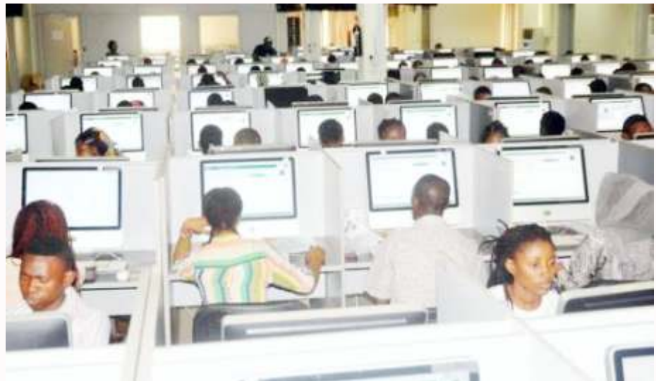
Candidates sitting UTME

In its bid to accommodate some exigencies, which ultimate goals are to ensure maximal benefits to potential candidates, the Joint Admissions and Matriculation Board (JAMB) has made adjustments to its examination timelines.