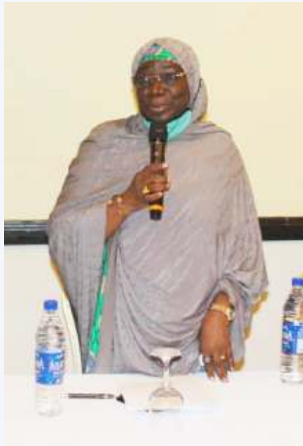
Prof. Ruqayyatu Rufai, Former Minister of Education

W orried by the alarming rate of undisclosed illegal institutional admissions in the nation's tertiary institutions, stakeholders in the education sector have called for stiffer sanctions to curb the menace.