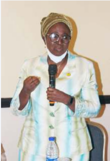
Prof. Chinwe Obaji, Former Minister of Education.