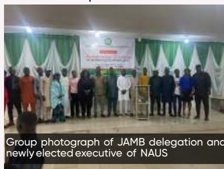
Group photograph of JAMB delegation and newly elected executive of NAUS