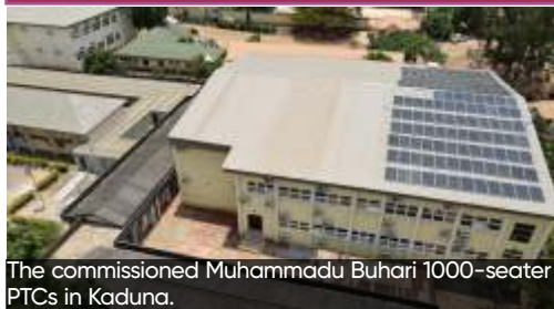
The commissioned Muhammadu Buhari 1000-seater PTCs in Kaduna.