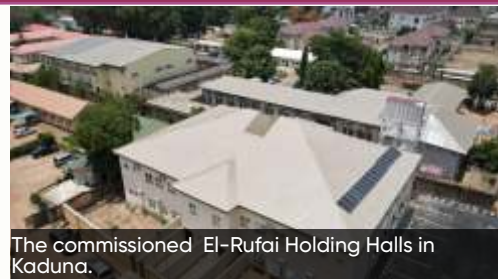
The commissioned El-Rufai Holding Halls in Kaduna.