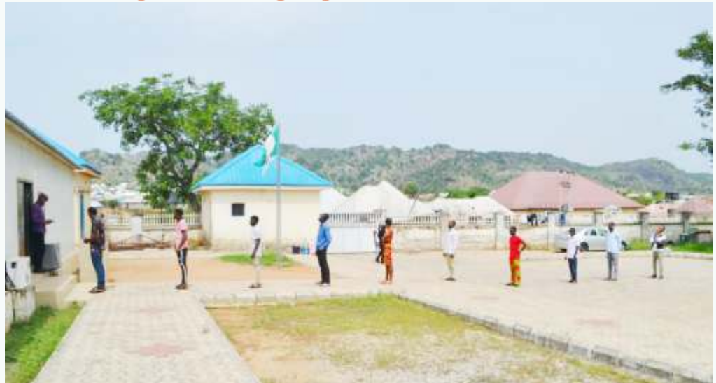
Candidates on a queue for UTME/DE registration at a Professional Registration Centre (PRC)

The partnership between the Joint Admissions and Matriculation Board (JAMB) and the National Identity Management Commission (NIMC) is yielding desired results as the process which, by all indications, was deemed impracticable in 2019 and had to be shelved, was re-introduced