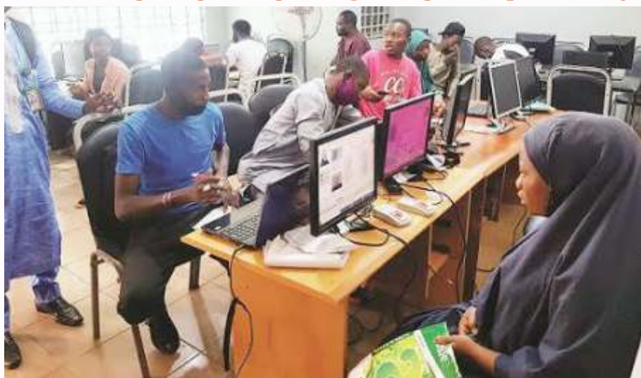
UTME/DE Candidates registration going on in a Professional Registration Centre (PRC)

The Management of the Joint Admissions and Matriculation Board (JAMB) has approved the constitution of a Management Committee to monitor the ongoing 2022 UTME registration exercise nationwide.