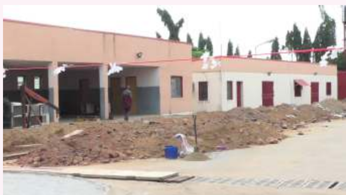
OLD GENERAL SERVICES DEPARTMENT