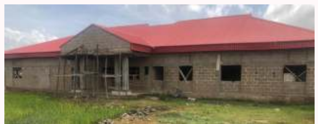
NEW ADAMAWA STATE OFFICE YOLA UNDER CONSTRUCTION IN CONJUNCTION WITH NCC