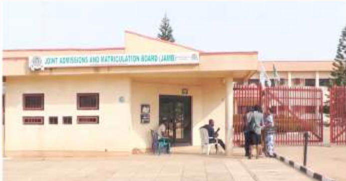
OLD GATE HOUSE AT THE HEADQUARTERS