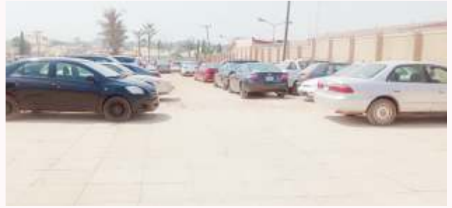
NEW PARKING LOT AT THE HEADQUARTERS