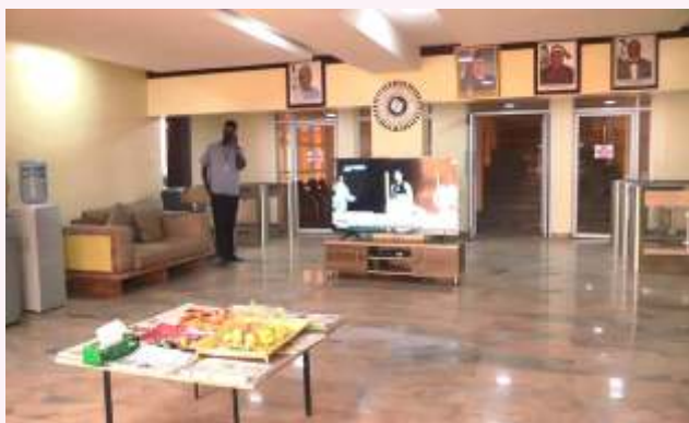
NEW RECEPTION AT THE HEADQUARTERS