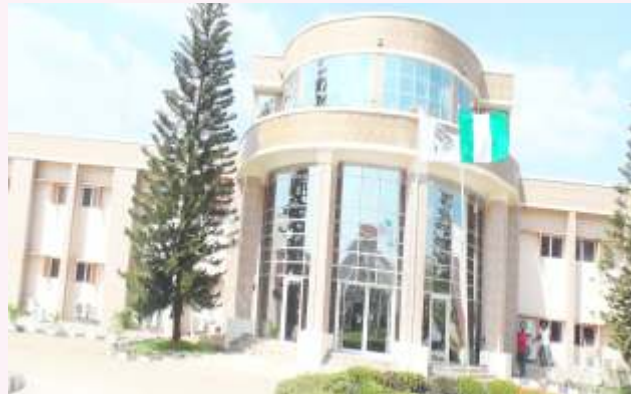
OLD AND NEW JAMB NATIONAL HEADQUARTERS, BWARI, ABUJA