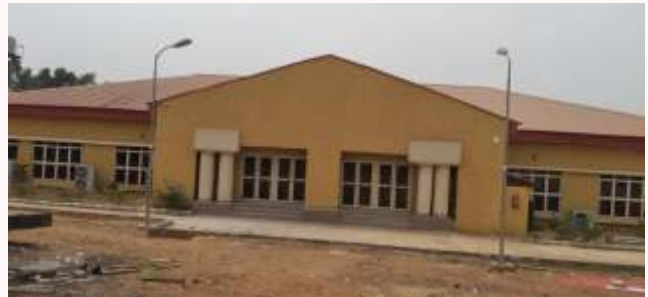
NEW ABEOKUTA OFFICE BUILT IN CONJUNCTION WITH NCC