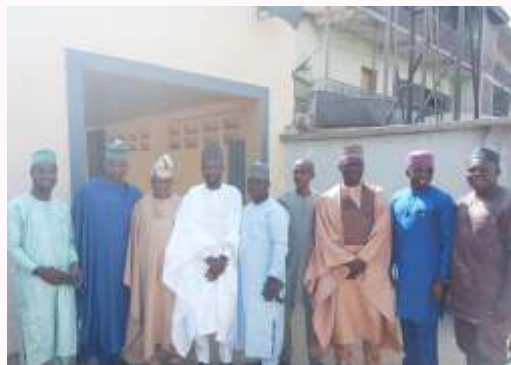
Cross section of dignitaries at the event