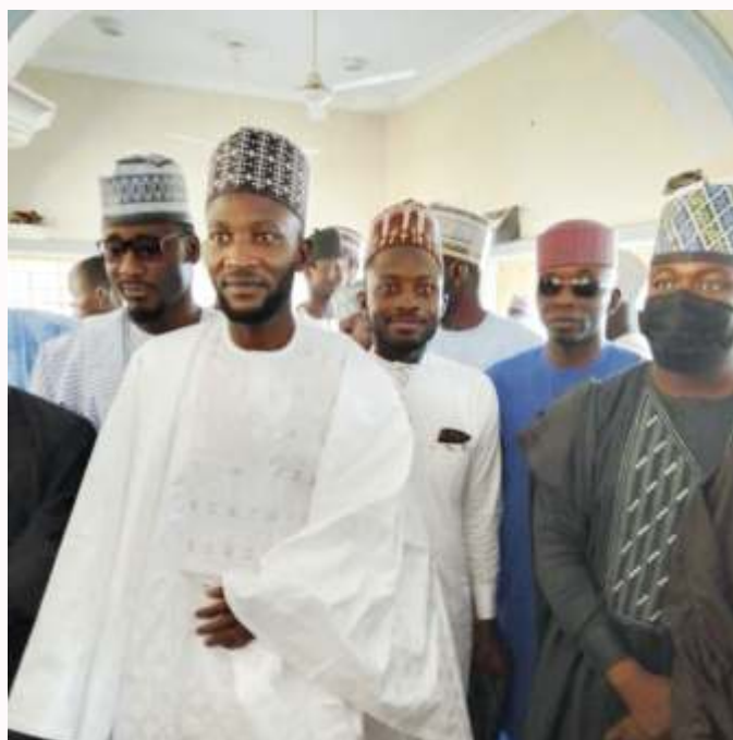
The groom clad in white agbada and friends