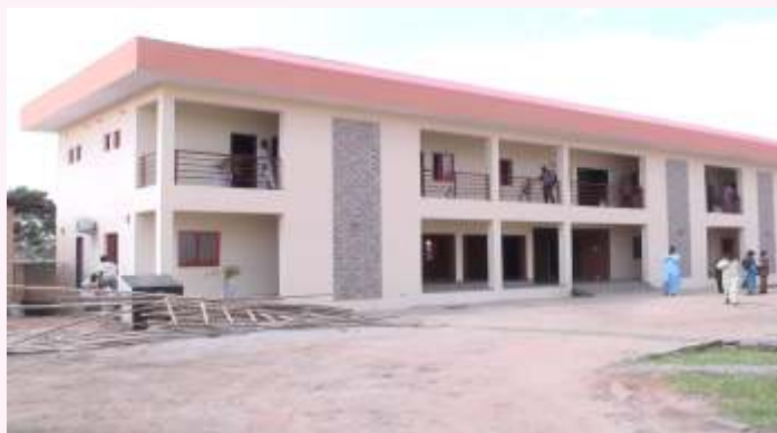
NEW GENERAL SERVICES DEPARTMENT