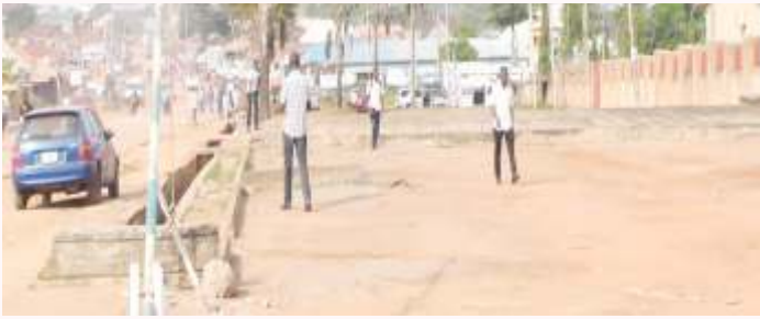
OLD PARKING LOT AT THE HEADQUARTERS