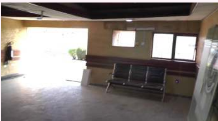
OLD RECEPTION AT THE HEADQUARTERS