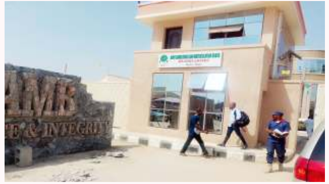
NEW GATE HOUSE AT THE HEADQUARTERS