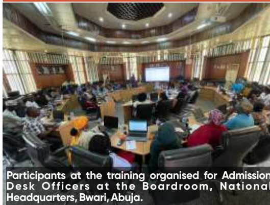
Participants at the training organised for Admission Desk Officers at the Boardroom, National Headquarters, Bwari, Abuja.