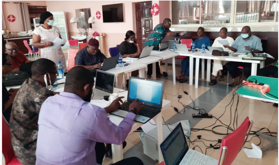
Participants during the Capacity Building Workshop on Critical Assessment Competences

The Joint Admissions and Matriculation Board (JAMB) has organised a capacity building workshop on critical assessment competences for tertiary education lecturers in Nigeria.