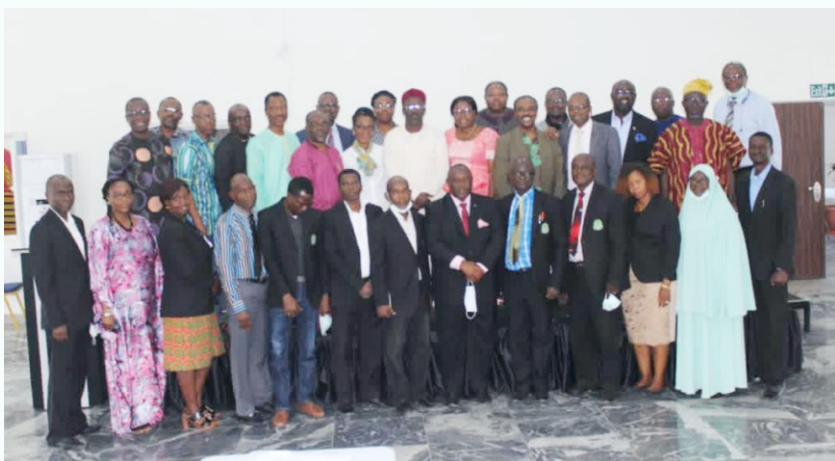
Participants during the WACP training on Psychometric Properties organised by JAMB.

The Joint Admissions and Matriculation Board (JAMB) has trained the West African Council of Physicians (WACP) on the rudiments of conducting Computer-Based Examinations for its candidates employing psychometrics principles.