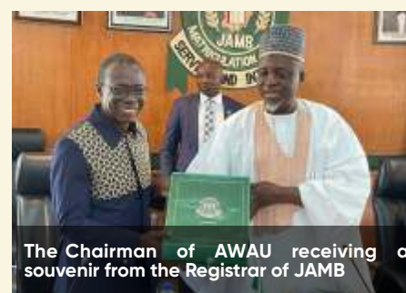
The Chairman of AWAU receiving a souvenir from the Registrar of JAMB