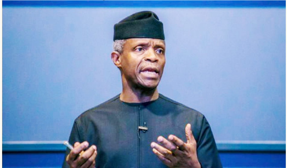
Prof. Yemi Osinbajo, Vice President, Federal Republic of Nigeria.

The Vice President, Federal Republic of Nigeria, Prof. Yemi Osinbajo, has reiterated the government's determination to better the fortunes of education in the country.