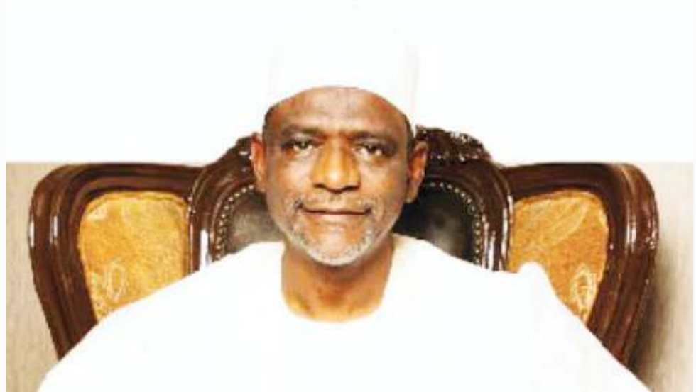
The Honourable Minister of Education, Malam Adamu Adamu

The Hon. Minister of Education, Mallam Adamu Adamu, has approved Tuesday, 31 August, 2021 for the 2021 Policy Meeting.