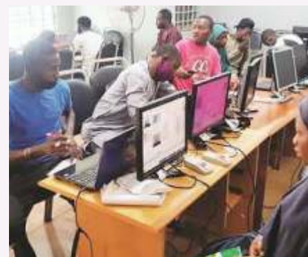
Registration of Candidates going on in a Professional Registration Centre (PRC)

The general public is to note that it is practically impossible for the Board to even contemplate any extension of registration as sister examination bodies such as WAEC NECO and NABTEB, have their allotted time which the Board cannot usurp.