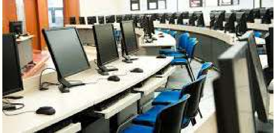
An accredited Professional Testing Centre (PTC)

In fulfilment of its promise to remit to the CBT centres, the service charges which it had assisted the centres in collecting along with the N3,500 UTME/DE registration fees, the Joint Admissions and Matriculation Board (JAMB) has since remitted over N600m service charges to respective centres in line with the cashless policy of the Board, which represents the total number of candidates registered multiplied by N700. The CBT centres/PRCs owned by JAMB were, however, excluded from the payment.