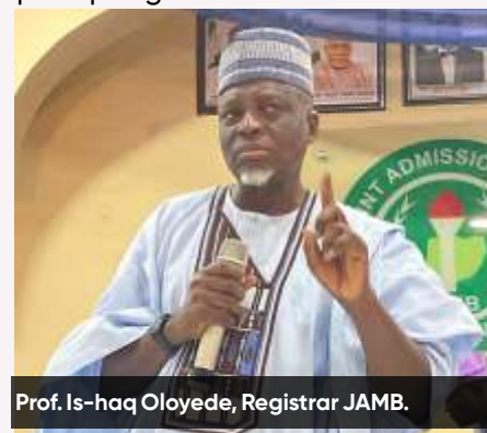
Prof. Is-haq Oloyede, Registrar JAMB.

appreciation to the Desk Officers for upholding the Board's image and integrity. He cited a scenario on the floor of the Senate during plenary on 8th November, 2023, where the Board was accused of complicity in admission racketeering with the University of Nigeria, Nsukka, by the Senator representing Ebonyi North, Sen. Nwebonyi Onyeka Peter, prompting the Senate President,