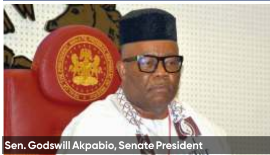
Sen. Godswill Akpabio, Senate President

The Joint Admissions and Matriculation Board (JAMB) has expressed appreciation to the Senate, particularly the Senate President for vouching for the integrity of the Board. The Registrar, who stated this while giving his remarks at the closing ceremony of the JAMB SERVICOM Customer Service Week,