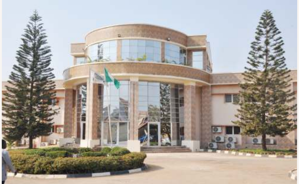
JAMB National Headquarters, Bwari-Abuja.

The Joint Admissions and Matriculation Board has received complaints from some parents and students that one or two institutions are collecting money ranging from N10,000 to N80,000 from candidates purportedly for the processing of late or irregular admissions. The Board unequivocally dissociates itself from this exploitative act as it has not