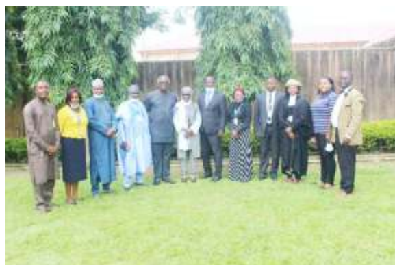
Newly-elected executive committee of JAMB-ACTU in a group photograph with officials of ICPC.