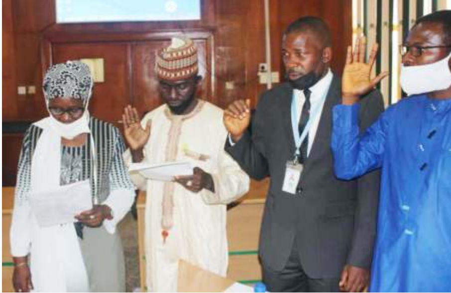
The newly-elected executive committee of JAMB-ACTU taking their oaths of office.