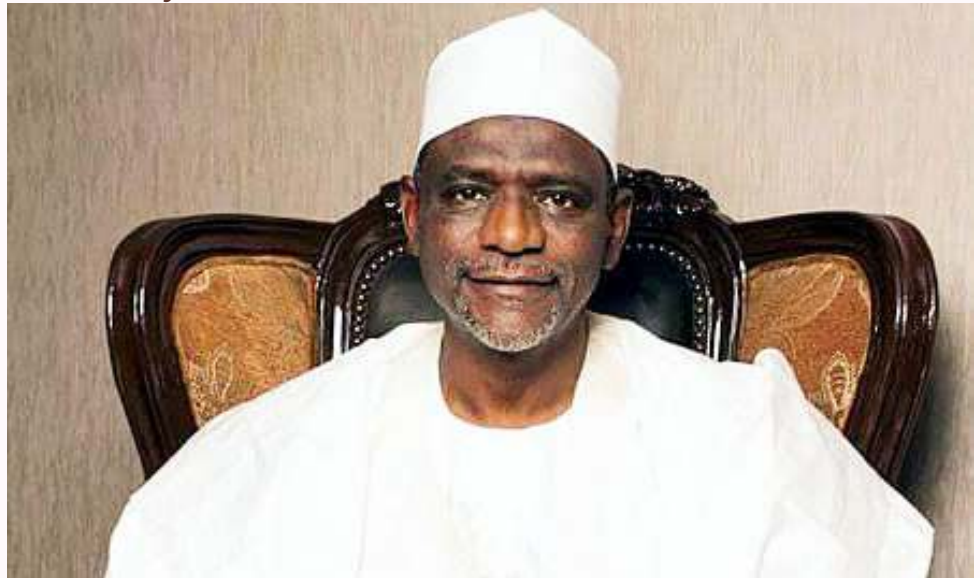
Malam Adamu Adamu, the Honourable Minister of Education.

Says...Admission Outside CAPS Is Null And Void