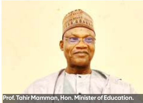
Prof. Tahir Mamman, Hon. Minister of Education.