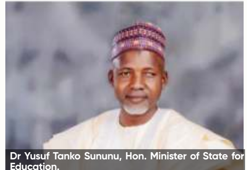
Dr Yusuf Tanko Sununu, Hon. Minister of State for Education.

As part of strategies for implementing the Ministerial Roadmap for the Education Sector 2024 - 2027, a two-day brainstorming retreat towards adopting the draft monitoring and evaluation plan and framework for its implementation has been held.