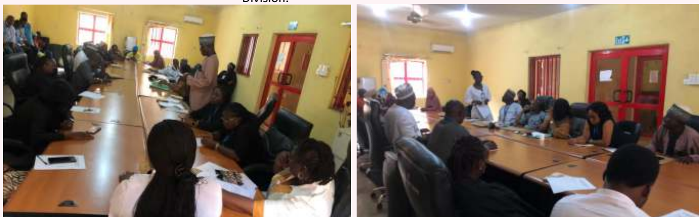
Cross section of participants at the training for staff organised by Quality Assurance Department.

Other presentations were given on such topics as the "Conception and Establishment of the Board", "Functions of Quality Assurance", among others.