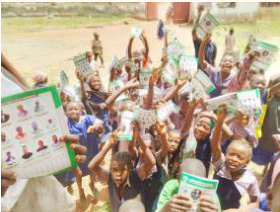
Pupils display exercise books donated by AISA

T he Abuja Indigenous Students Association (AISA) has paid a total sum of three hundred and ten thousand naira (₦310, 000) only as registration fees for sixty-two (62) members of its Association participating in the 2022 Unified Tertiary Matriculation Examination (UTME) across the Federal Capital Territory (FCT).