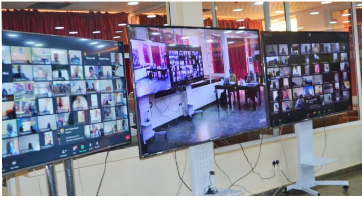
Participants at the meeting with heads of tertiary institutions.