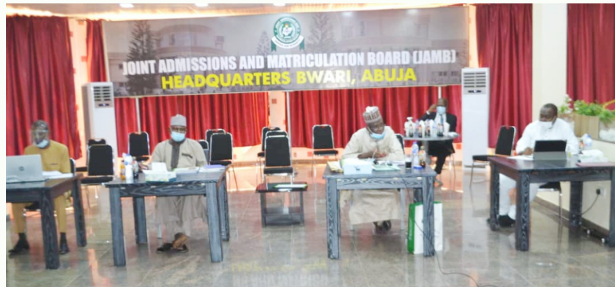
A virtual meeting with Heads of Tertiary Institutions at the Board's National Headquarters.

... As JAMB Urges Compliance To Advisories On Transfer, Change Of Programmes And Institutions