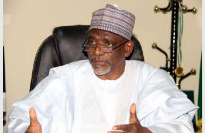
■ The Honourable Minister of Education, Mallam Adamu Adamu.

The Board has been charged to sustain its hallmark of inclusiveness, transparency, accountability and the enviable position it is occupying