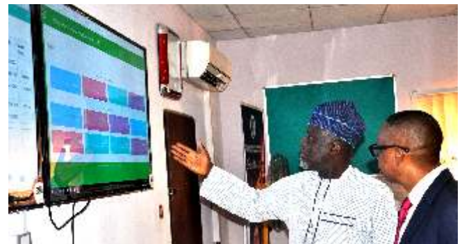
JAMB Registrar analysing admissions statistics using data from CAPS