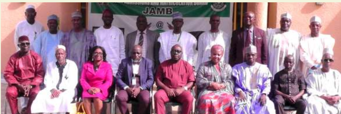
■ The Board Chairman, The Registrar and members of the 10th Governing Board of JAMB