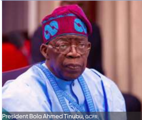
President Bola Ahmed Tinubu, GCFR.

In a landmark policy directive, the Federal Government has abolished the prevailing HND dichotomy and prioritised Technical and Vocational Education (TVE).