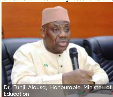
Dr. Tunji Alausa, Honourable Minister of Education

"The beauty of any agreement is not at the point of signing; it is at the implementation phase. In fact, before today, we have already started implementation with the release of the circular backing all the various welfare components of the agreement.