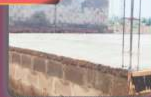
PROPERTY TYPE 3

DEVELOPMENT UP TO DAMP PROOF COURSE (450sqm)