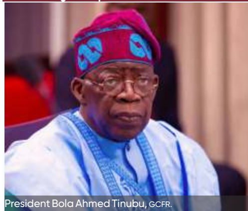
President Bola Ahmed Tinubu, GCFR.

...As FG Begins Implementation Of 2009 Renegotiated Agreement With ASUU