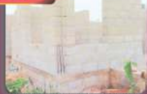
PROPERTY TYPE 1