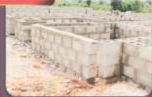
PROPERTY TYPE 4