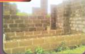
PROPERTY TYPE 2

DEVELOPMENT UP TO WINDOW LEVEL (450sqm) ₦9,500,000.00