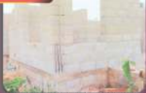
PROPERTY TYPE 1

DEVELOPMENT UP TO LINTEL LEVEL (450sqm) ₦10,500,000.00