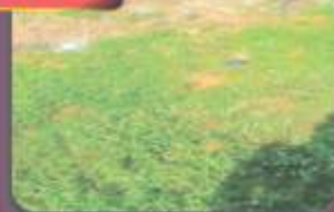
PROPERTY TYPE 5

PLOT OF LAND RIPE FOR DEVELOPMENT (450sqm) ₦3,500,000.00