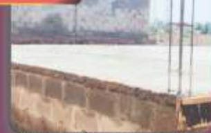
PROPERTY TYPE 3

DEVELOPMENT UP TO DAMP PROOF COURSE (450sqm) ₦7,500,000.00