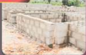
PROPERTY TYPE 4

DEVELOPMENT UP TO FOUNDATION (450sqm) ₦6,000,000.00