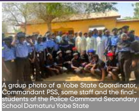
A group photo of a Yobe State Coordinator, Commandant PSS, some staff and the final-year students of the Police Command Secondary School Damaturu Yobe State

The Yobe State Office of the Joint Admissions and Matriculation Board (JAMB) on Wednesday, 28th January, 2026, hosted a delegation from the Police Command Secondary School, Damaturu, Yobe State, who were on a familiarization visit.