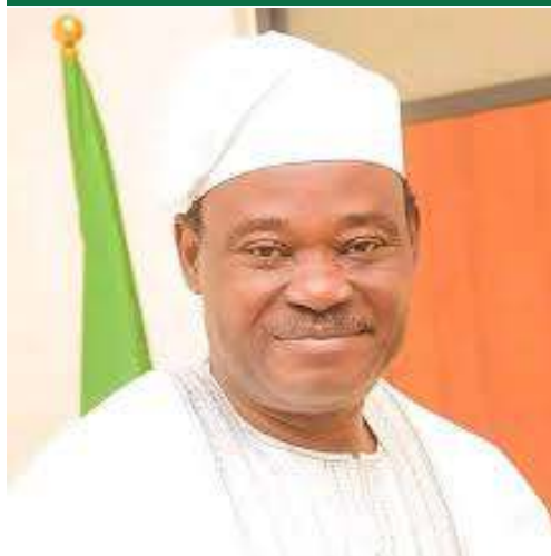
Senator Jimoh Ibrahim

The Founder of University of Fortune, Igbotako, Okitipupa Local Government Area of Ondo State, Senator Jimoh Ibrahim, has reiterated his commitment to building a world-class citadel of learning in Nigeria. The Senator made this known when he