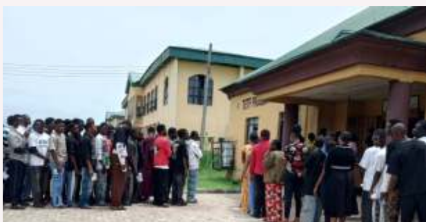
Cross-section of candidates queueing up for Biometric verification @ Delta State University, Campus 3, centre 1, Abraka.