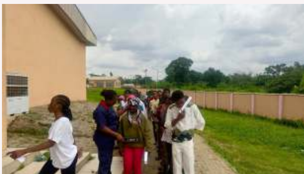
Candidates being screened at the University of Ibadan Distance Learning Centre 2, Ibadan, Oyo State