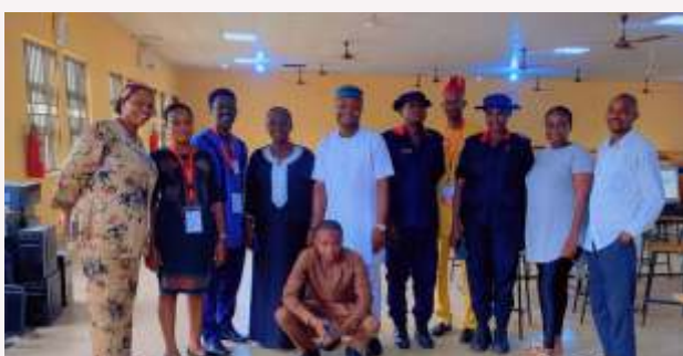
Some team members after the last session of UTME 2025 at Abraham Adesanya Polytechnic JKK CBT Centre, Ijebu Igbo, Ogun State on the 26th April, 2025