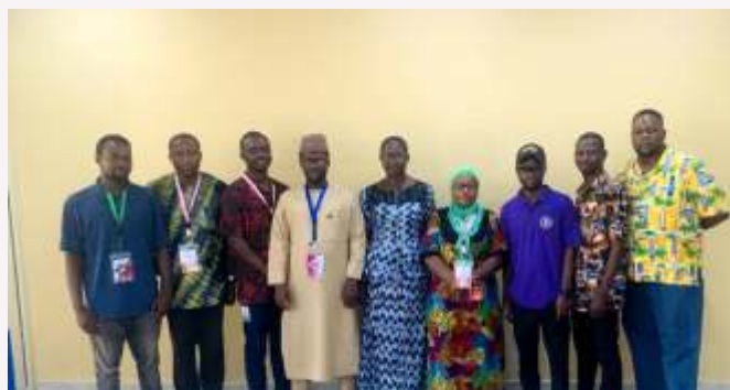
Field Officers at Bishop Felix Owolabi Int'l Academy Oshogbo CBT Centre Hall B after a successful 2025 UTME