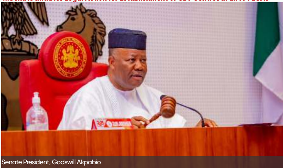
Senate President, Godswill Akpabio

Examination (UTME) conducted by the Joint Admissions and Matriculation Board (JAMB).