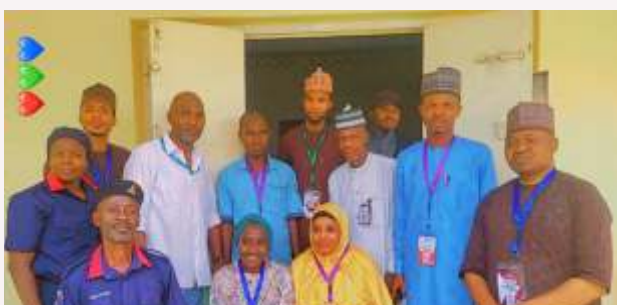
Examination Officers at AMLAK TECHNOLOGY, CBT CENTRE, GUSAU, ZAMFARA STATE.