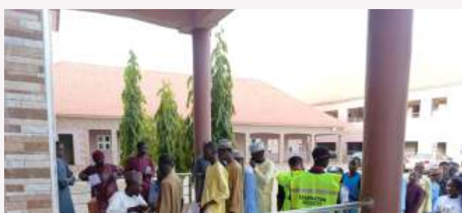
Candidates being screened and verified at BAKHITA ICT CENTER SOKOTO