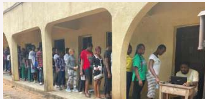
St Augustine CBT Centre 2 , Akpugo, Enugu state, undergoing biometric verification for 4th session today.