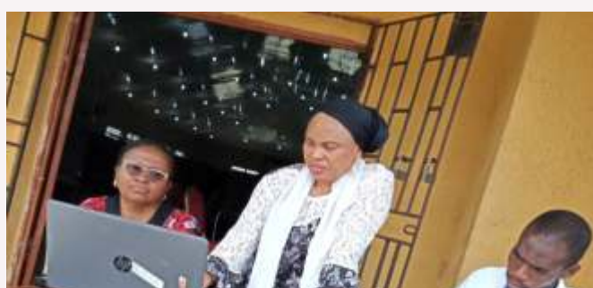
Examination Officers at the Biometric capturing point before the beginning of the exam, at Campus 3, Centre 1, Delta State University Abraka.