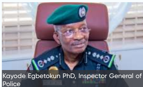
Kayode Egbetokun PhD, Inspector General of Police