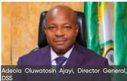
Adeola Oluwatosin Ajayi, Director General, DSS

Consequently, 113 CBT centres have been delisted or suspended from across the country. Some other implicated in multiple infractions in the main or resit examinations exercise.