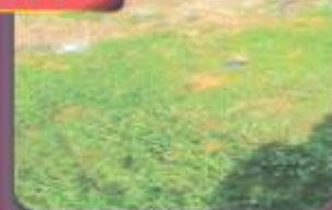
PROPERTY TYPE 5

PLOT OF LAND RIPE FOR DEVELOPMENT (450sqm) ₦3,500,000.00