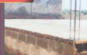
PROPERTY TYPE 3

DEVELOPMENT UP TO DAMP PROOF COURSE (450sqm) ₦7,500,000.00