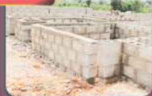
PROPERTY TYPE 4

DEVELOPMENT UP TO FOUNDATION (450sqm) ₦6,000,000.00