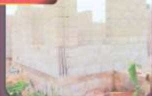
PROPERTY TYPE 1

DEVELOPMENT UP TO LINTEL LEVEL (450sqm) ₦10,500,000.00