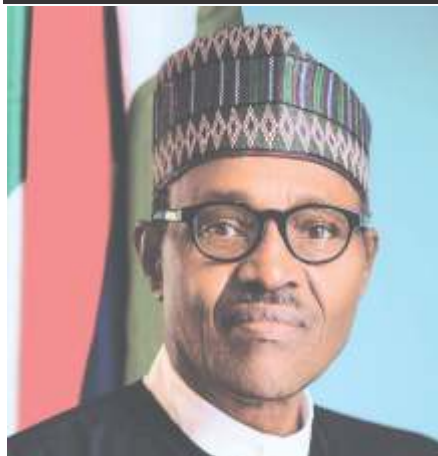
Late Muhammadu Buhari, former President of The Federal Republic of Nigeria.

The Joint Admissions and Matriculation Board (JAMB) stands united in profound sorrow as we reflect on the passing of former President Muhammadu Buhari, who departed this world after a brief illness on Sunday, July 13, 2025, at the venerable age of 82. His legacy, particularly in the realm of education, is one that will resonate through the corridors of history, marking him as a transformative leader whose vision reshaped the educational landscape of Nigeria. President Buhari's tenure was characterized by groundbreaking innovations and unwavering commitment to expanding access to tertiary education. Under his stewardship, the establishment of numerous educational