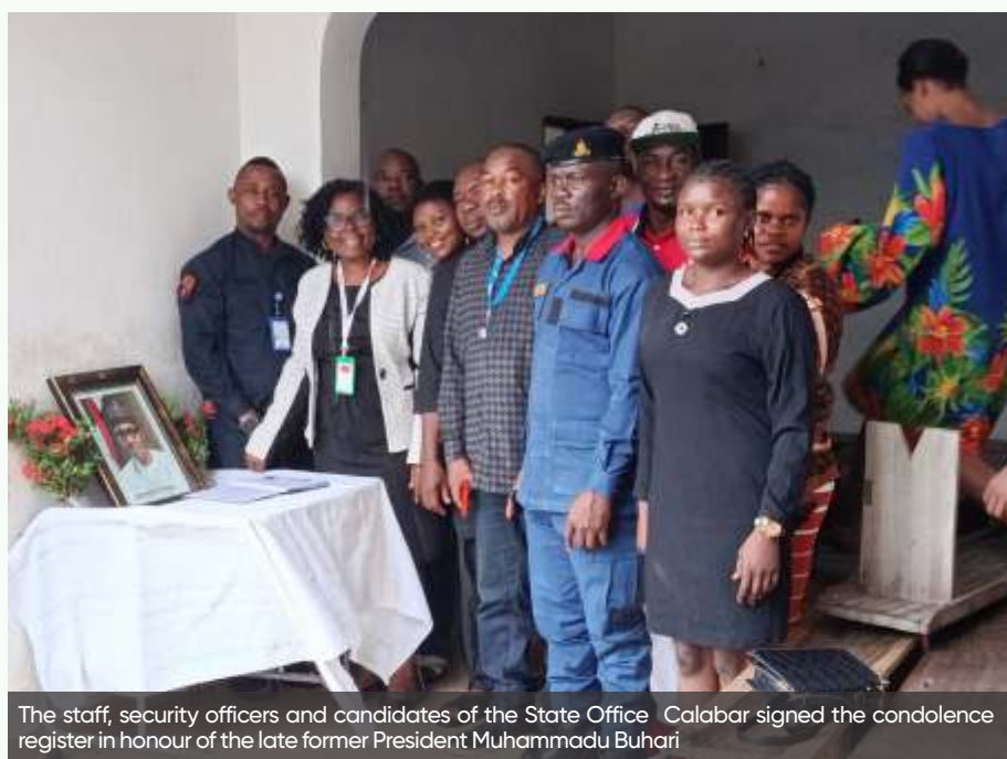
The staff, security officers and candidates of the State Office Calabar signed the condolence register in honour of the late former President Muhammadu Buhari

While we mourn his departure, we also celebrate the enduring marks he has left on our nation. The Board, the education system, and indeed, the entirety of Nigeria will forever cherish the impactful contributions of a leader who prioritized knowledge and enlightenment. His vision will continue to inspire our collective efforts toward building a more educated and prosperous Nigeria, ensuring that his legacy endures for years to come.