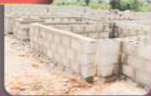
PROPERTY TYPE 4

DEVELOPMENT UP TO FOUNDATION (450sqm) ₦6,000,000.00