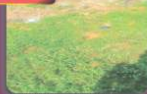
PROPERTY TYPE 5

PLOT OF LAND RIPE FOR DEVELOPMENT (450sqm) ₦3,500,000.00