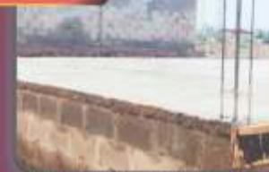
PROPERTY TYPE 3

DEVELOPMENT UP TO DAMP PROOF COURSE (450sqm) ₦7,500,000.00