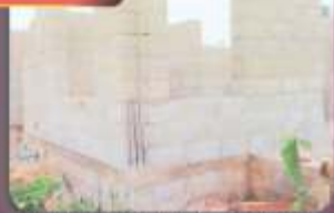
PROPERTY TYPE 1

DEVELOPMENT UP TO LINTEL LEVEL (450sqm) ₦10,500,000.00