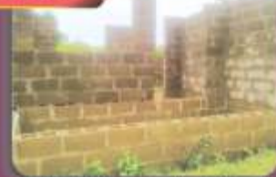
PROPERTY TYPE 2