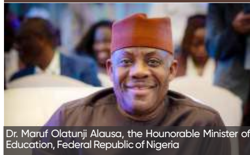
Dr. Maruf Olatunji Alausa, the Honourable Minister of Education, Federal Republic of Nigeria

The Federal Government has placed a seven-year hold on creation of any new federal universities, polytechnics, or colleges of education in the country.