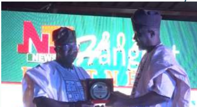
The Registrar of JAMB receiving the award of Recognition during the NTA 2025 recognition awards ceremony.

economy were recognised, describing the ceremony as the station's way of saying "thank you" to individuals and organisations that had consistently supported its programmes by availing themselves to explain government policies to the public.