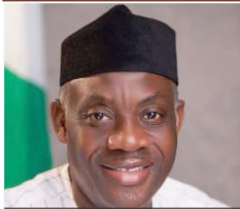
The Honorable Minister of Education, Dr. Maruf Olatunji Alausa.

The Registrar of the Joint Admissions and Matriculation Board (JAMB), Prof. Is-haq Oloyede, has been commended for his outstanding contributions to the education sector by the Hon. Minister of Education, Dr. Maruf Olatunji Alausa.