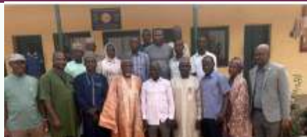
The Registrar in a group photograph with staff of Adamawa and Taraba State offices with some members of management during the Registrar's interactive meeting with staff of Adamawa and Taraba State offices.