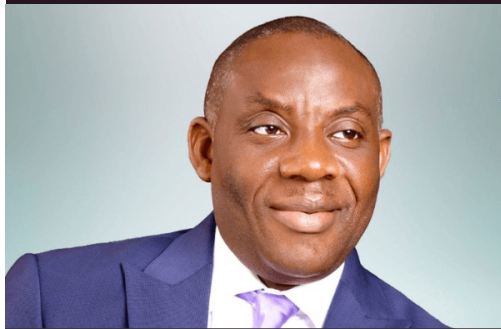
Dr. Maruf Olatunji Alausa, the Honourable Minister of Education, Federal Republic of Nigeria

The Federal Government has again reiterated its resolve to digitalise all examination processes in the country noting that the "mass failure" recorded in the recently-released Unified Tertiary Matriculation Examination (UTME) by the Joint Admission and Matriculation Board (JAMB) is proof that anti-malpractice measures are working. The Honourable Minister of Education, Dr.