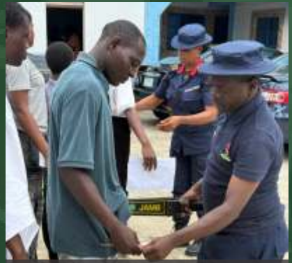
NSCDC in action – scanning candidates for verification at CTR 286 – IZISCO OBOS INSTITUTE OF MARITIME STUDIES.