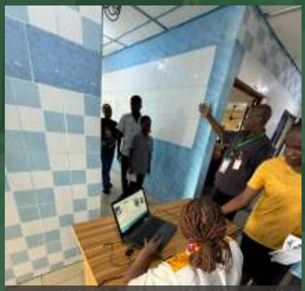
BVR Verifying Candidates.CTR 286 - IZISCO OBOS INSTITUTE OF MARITIME STUDIES.