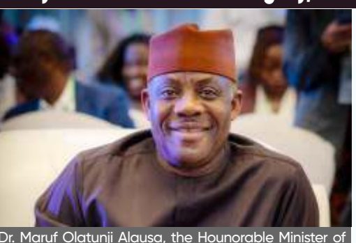
Dr. Maruf Olatunji Alausa, the Hounorable Minister of Education, Federal Republic of Nigeria

...Says UTME A Model of Integrity, International Best Practices