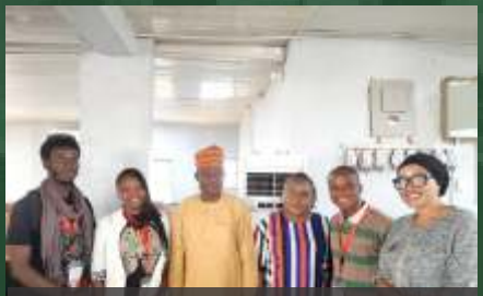
JAMB 2025 UTME Team at Early Heights college CBT center Alagbole Ogun State.