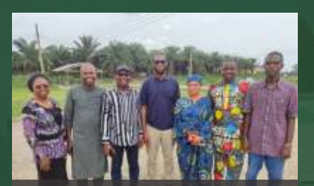
JAMB 2025 UTME Team at DELSU CAMPUS3(Ctr1&2)