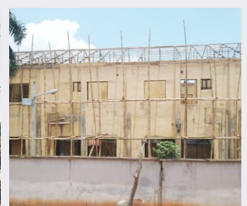
ON GOING REMODELLING