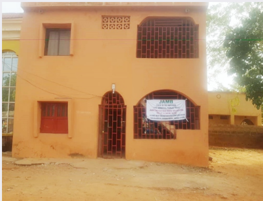
OLD KEBBI OFFICE