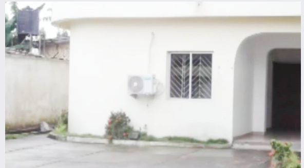
NEW CALABAR OFFICE