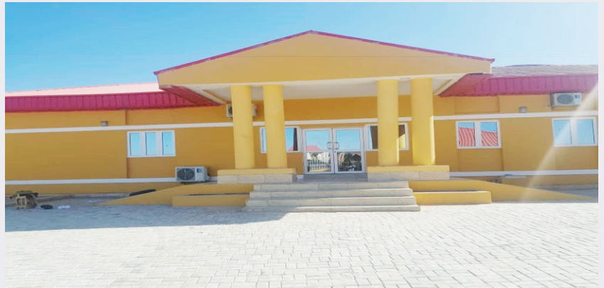
NEW KEBBI OFFICE