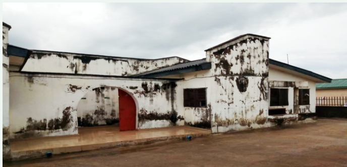
OLD KOGI OFFICE