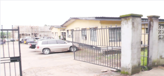
OLD CALABAR OFFICE