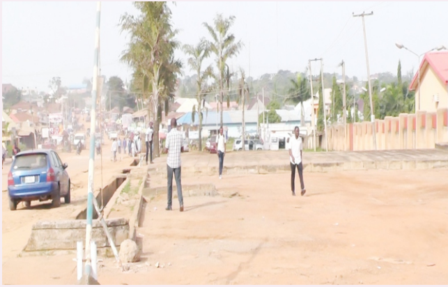
OLD PARKING LOT AT THE HEADQUARTERS