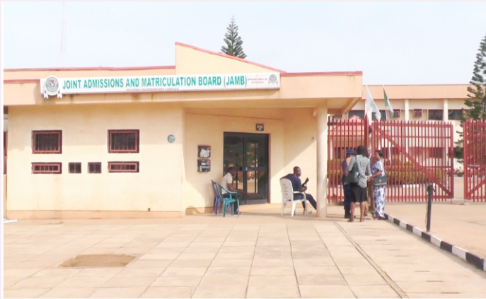
OLD GATE HOUSE AT THE HEADQUARTERS