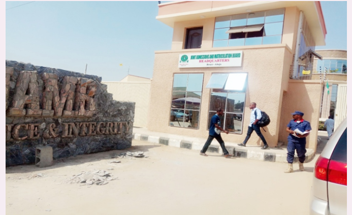
NEW GATE HOUSE AT THE HEADQUARTERS