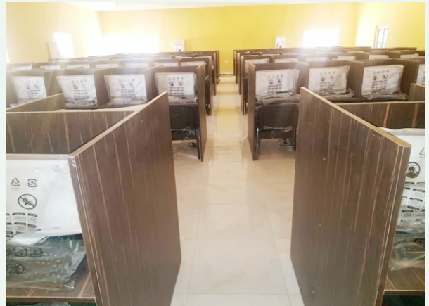
NEW KEBBI CBT CENTRE