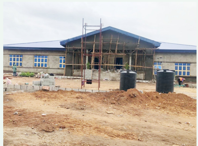
ONGOING CONSTRUCTION OF MEGA CENTRE IN KOGI