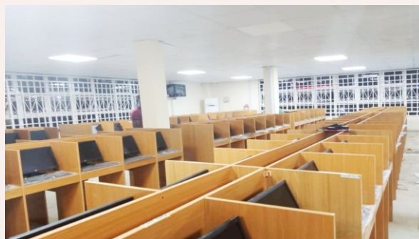
NEWLY CONSTRUCTED MEGA CENTRE HOSTING THREE CBT CENTRES IN OWERRI