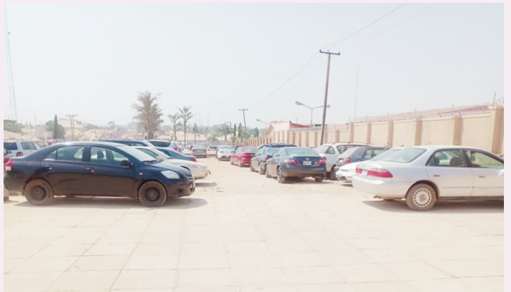
NEW PARKING LOT AT THE HEADQUARTERS