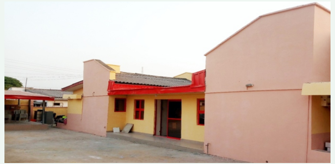
NEW KOGI OFFICE