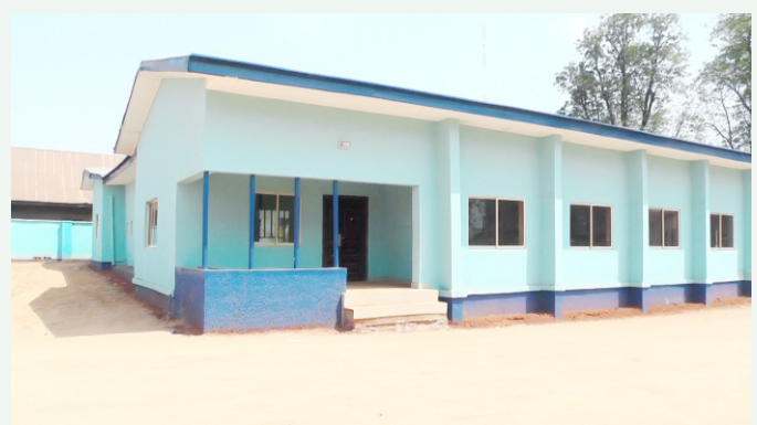
NEW LAFIA OFFICE