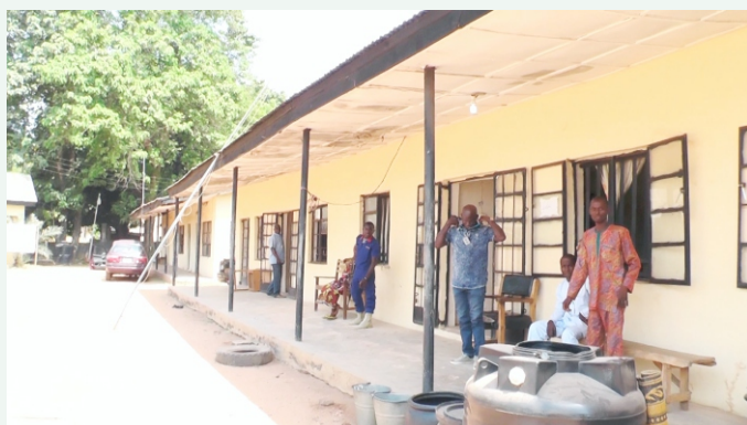
OLD LAFIA OFFICE