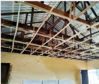
OLD ENUGU ZONAL OFFICE