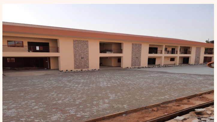
OLD GENERAL SERVICES DEPARTMENT