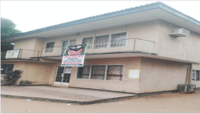
OLD BENIN OFFICE