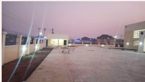
NEW OWERRI OFFICE