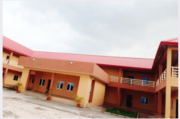
NEW BENIN OFFICE